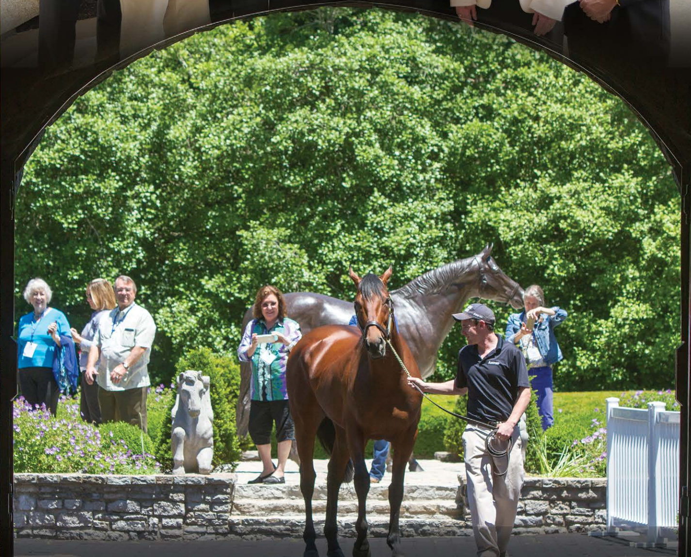
Tours offered as part of Farm Foundation Round Table meetings are an opportunity for members and guests to learn more about the multiple and diverse segments that comprise the nation's food and agriculture sector.